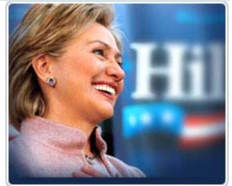
Hillary Rodham Clinton