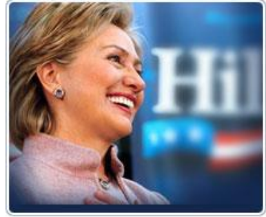
Hillary Rodham Clinton